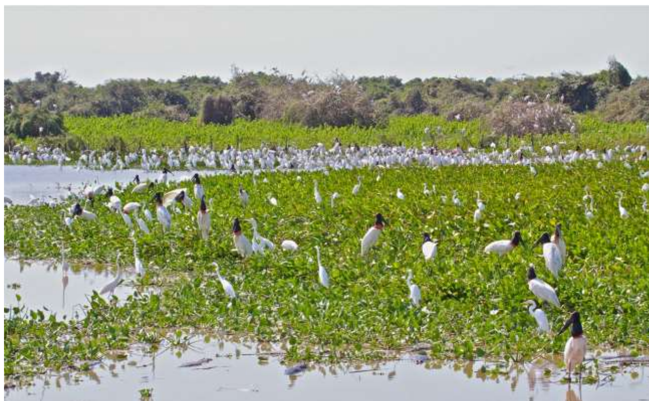
Jabirus and egrets, rio Bento Gomes, Transpantaneira

herons, ibis, storks, cormorants, raptors, and kingfishers will immediately recall Africa to those who have been there. Small birds are equally conspicuous, and daily lists of over 100 species are not unusual. Among the prizes we'll seek are Maguari Stork, Jabiru, Plumbeous Ibis, Southern Screamer, Chaco Chachalaca, White-throated (Gray's) Piping-Guan, Chestnut-bellied Guan, Bare-faced Curassow, Sunbittern, Sungrebe, the incomparable Hyacinth Macaw, Yellow-collared Macaw, Nanday Parakeet, Turquoise-fronted Parrot, Long-tailed Ground-Dove, Nacunda Nighthawk, Buff-bellied Hermit, Blue-crowned Trogon, Toco Toucan, Purplish Jay, Pale-crested and White woodpeckers, Great Rufous Woodcreeper, Red-billed Scythebill, Chotoy Spinetail, Gray-crested (Rufous) Cacholote, Mato Grosso Antbird, Large-billed Antwren, Black-backed Water-Tyrant, Helmeted Manakin, Fawn-breasted Wren, Green-backed Becard, Orange-backed Troupial, Variable Oriole, Scarlet-headed Blackbird, Yellow-billed Cardinal, Rusty-collared Seedeater and others. As an added bonus, our chances for seeing a Jaguar, the most spectacular predator in all of South America, are all but guaranteed. Each of our last 20+ visits here has resulted in amazing prolonged observations of one or more of these magnificent cats, and we have modified our itinerary in recent years to make our odds of success even more certain.